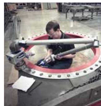
Large Urethane Lined Valve being measured with CMM arm.