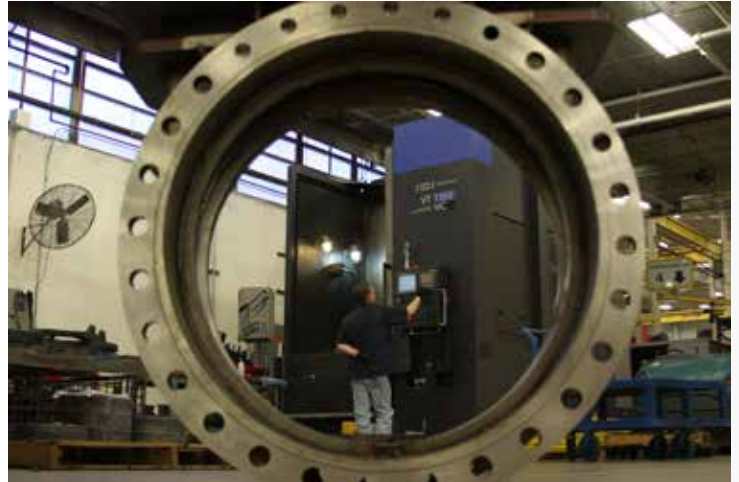
ITT machinist operating large CNC machining center.

From design to fabrication we focus on providing you with an extraordinary value in a valve that has the right design. Because we're not limited by valve type, size or materials, we can provide a wide range of design flexibility in our products.