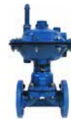
Dia-Flo® Diaphragm Valve