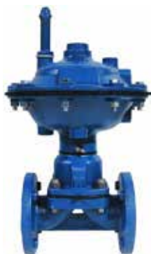
Dia-Flo® Diaphragm Valve

Many mines are heavy users of various types of aggressive chemicals. Rubber or plastic lined weir diaphragm valves are the valve of choice for chemical feed injection due to their throttling, ability to seal over solids, streamlined flow path and tolerance to crystallization.