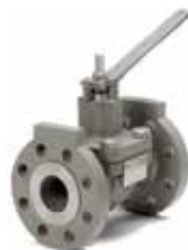
Cam-Tite® Ball Valve