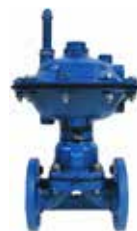
Dia-Flo® Diaphragm Valve