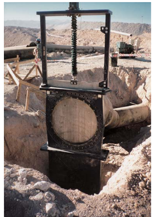
An ITT F133 ported slide gate valve installed in Northern Chile in a tailings application

The abrasiveness of the solids in the slurry is a key