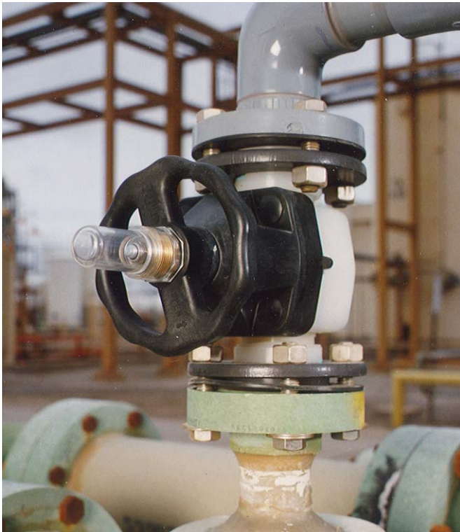
Solid Plastic Weir Type Valve on Acid Service