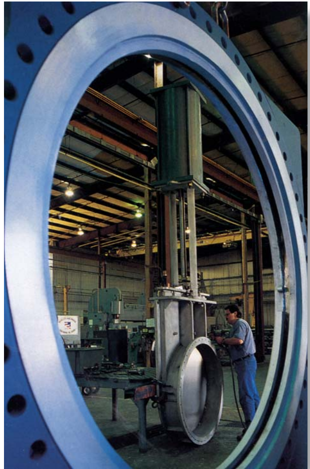
The largest knife gate valve we made in Amory, MS USA had a 96" internal diameter (the area of a 7' x 7' room)

Lined, cast or fabricated valve construction, the very nature of fabrication allows a maximum of flexibility in customizing to meet specific needs, materials, pressure rating and configuration.